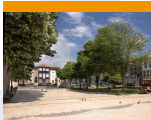
Praça do Almada