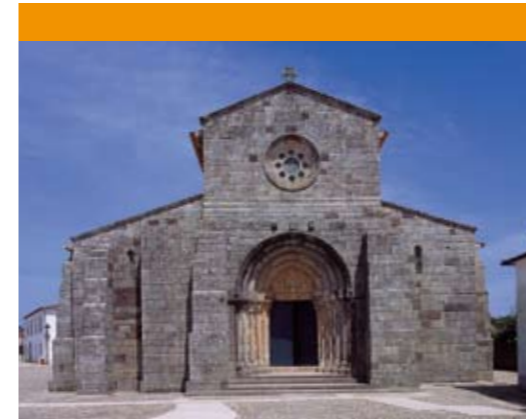
Igreja Românica de S. Pedro de Rates