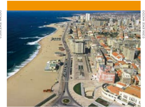
Praia da Póvoa

Póvoa offers top quality sports facilities where many international competitions take place. Among them are the 19 S. Pedro de Rates Shooting Area (4 Olympic ditches - they used trenches in the 1st W.W., 4 universal ditches, 5 propeller installations, 4 compact Sporting facilities); 20 indoor heated Olympic (size) Swimming pool; 21 Municipal Sports Hall; 22 Municipal Stadium, etc.