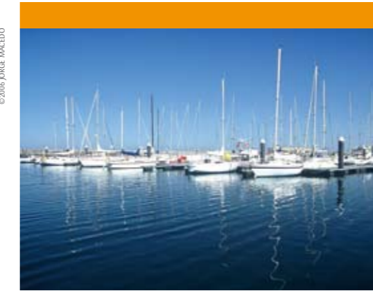
Marina da Póvoa